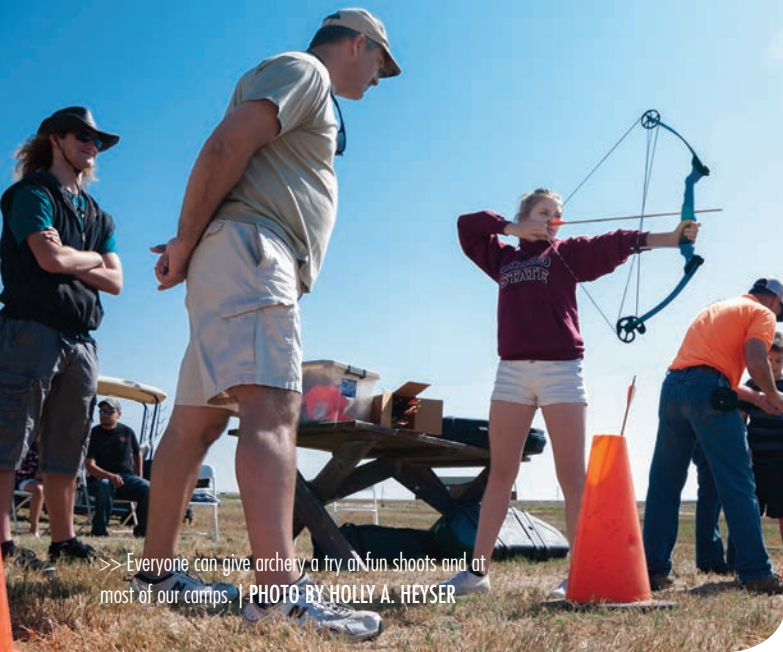
>> Everyone can give archery a try at fun shoots and at most of our camps.